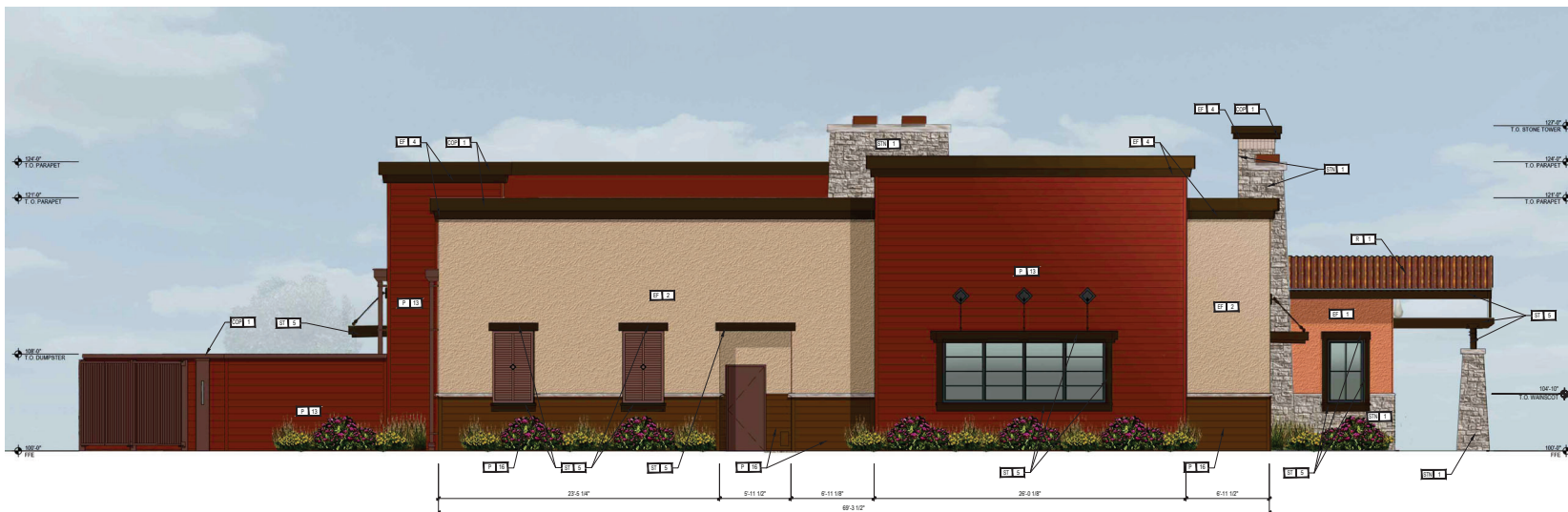
A1 LEFT ELEVATION (NORTH) SECONDARY FACADE