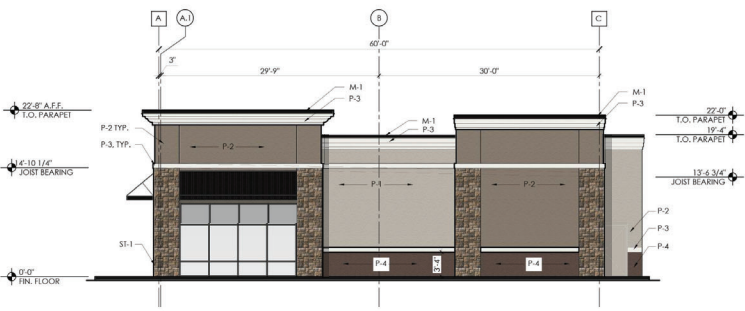
3 NORTH/SIDE ELEVATION SCALE: 1/8" = 1'-0"