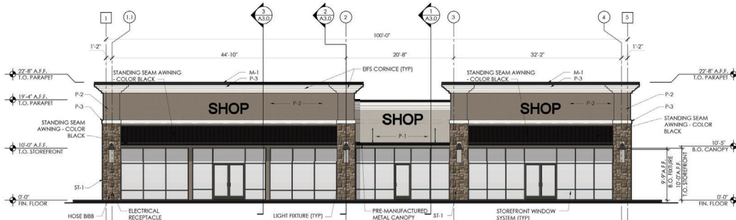
1 EAST/FRONT ELEVATION SCALE: 1/8" = 1'-0"